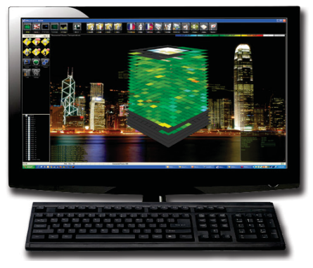
INNCOM INNcontrol 3 Application

The INNcontrol 3 software communicates with INNCOM in-room intelligent devices such as the e4 Smart Digital Thermostat and a variety of light switches, controllers, and other communication devices.