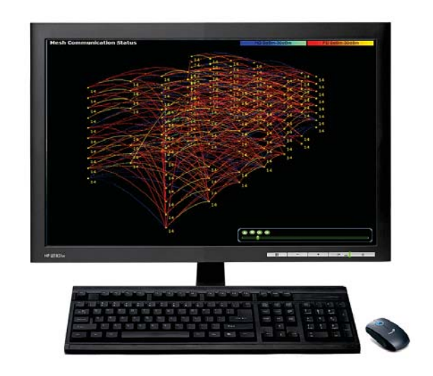
INNCOM Deep Mesh Screen